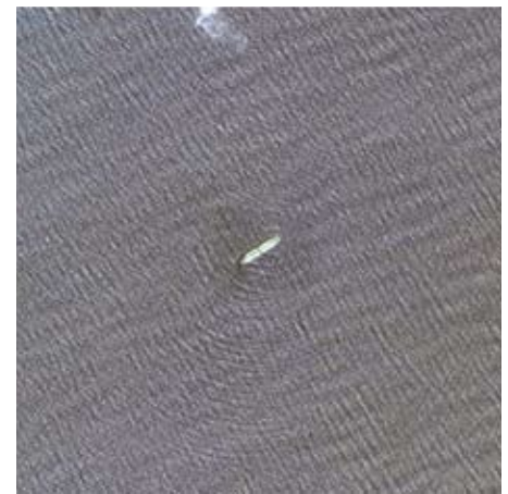
Italian tanker Savina Caylin hijacked by somalian pirates

In the end, DOLPHIN will produce 25 software tools and 3 decision support modules that will be used in regular operations and, according to End Users present within the project, will significantly improve their monitoring activities in the selected fields.